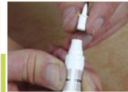
8 De-Aerate Pen

To protect the repaired area, apply a sealing with the AQUA Brush Pen Clear Lacquer. Before using the pen for the first time, rinse out brush tip under running water and dry it with the Cotton Cloth. Shake pen for about 30 seconds. Rattle of mixing balls must be clearly heard.