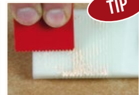
Cleaning of the Planer Grooves

When the repaired area has dried for a while (after approx. 5-10 minutes at room temperature), the sheen level of the sealed area can be adjusted with the Sanding and Polishing Cloth. The green side of the cloth polishes while the white side reduces the sheen level.