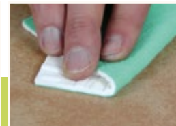
11 Sheen Level Adjustment

Apply the lacquer evenly in one direction to the repaired area. If possible, do not apply lacquer to the surroundings. If lacquer flow decreases, again squeeze area marked "P/PRESS" and slightly dab brush tip on the Cotton Cloth. After use, wash out brush tip with water and dab dry on a cloth.