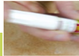
7 Shake Pen

Use the tip of the melter to apply the molten filler to the damaged area. Always slightly overfill the area. After each melting process, clean melter tip on the cotton cloth. Caution: Risk of burns.