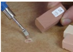
5 Color Adjustment

Use the sharp grooves of the Special Fillers Applicator to strip off excess material.