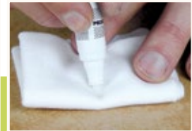
9 Activate Pen

Take off cap. Before each use, hold pen with tip pointing upwards in a cloth and squeeze area marked "P/PRESS". The pen is de-aerated.